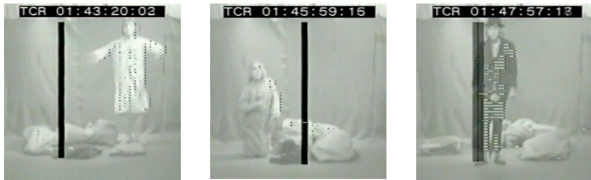
Figure 7: DIMI-O and Samuel Beckett's play Act without words in Oslo by a theater group Scene 7. Screen shot from the video in the Finnish National Gallery collections, Erkki Kurenniemi archive.

For a trip to Norway Kurenniemi wrote an application for a grant and outlined performance instructions for an intermedia work DEAL (1971) where a dancer creates his or her own musical accompaniment by dancing in front of the video camera of the instrument. DEAL was performed once in Oslo in 1972. Other experiments with the instrument included psychological tests and experimental theater. In Oslo Norwegian theater group performed Samuel Beckett's play Act without words in front of the DIMI-O's camera (See Figure 7). In psychological tests, DIMI-O's camera was reading testees' facial gestures while they were reading Rorschach pictures. Eventually, DIMI-O was sold to Lundsten's studio where it was frequently used until the dismantling of Andromeda in the spring 2014.